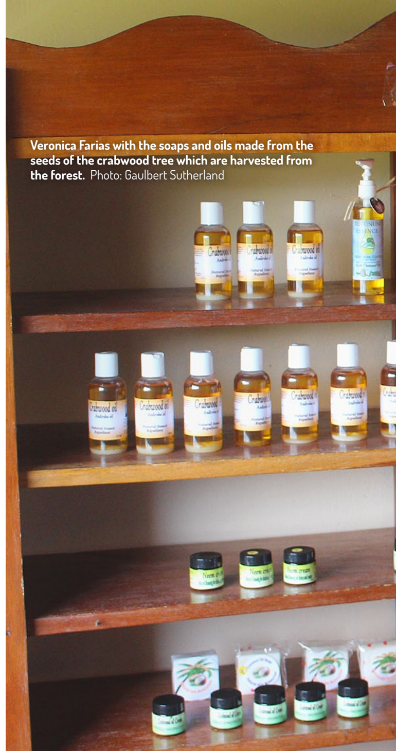
Veronica Farias with the soaps and oils made from the seeds of the crabwood tree which are harvested from the forest.

For indigenous communities, the destruction wrought by mining has been alarming. As has the granting of forest concessions close to indigenous lands.