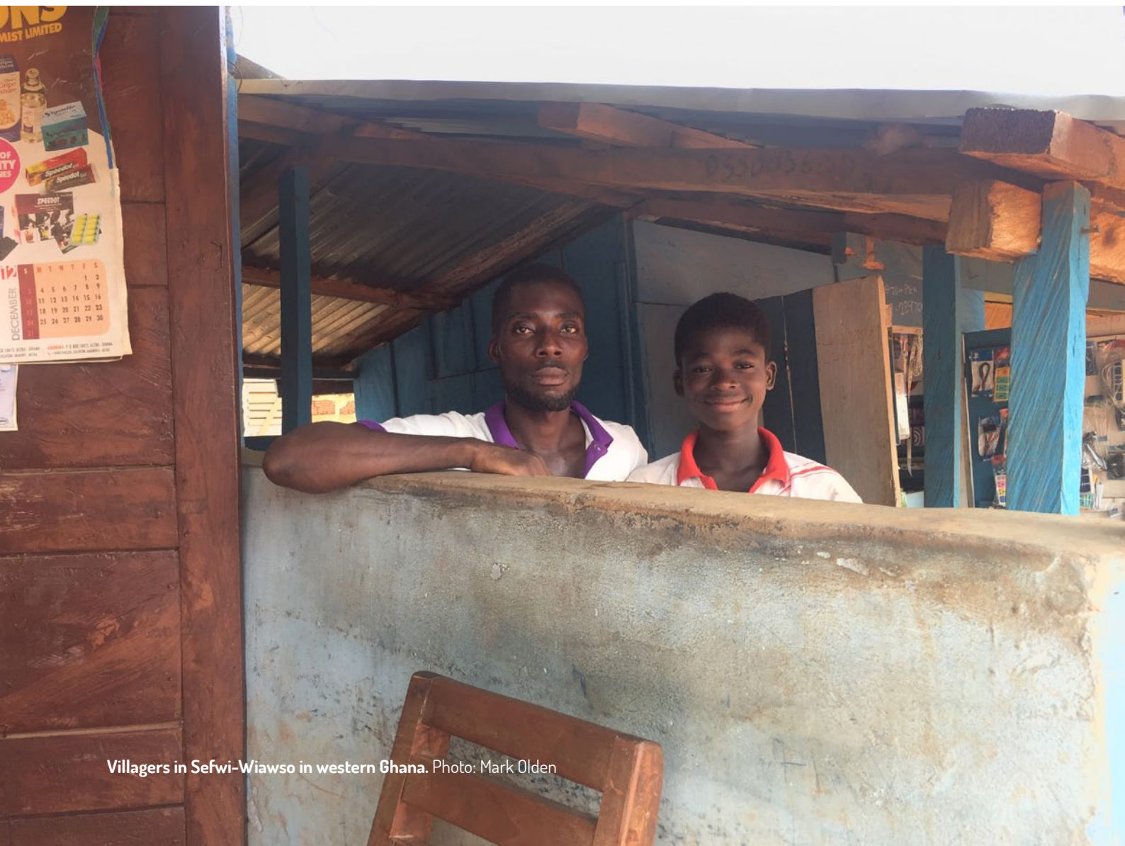
Villagers in Sefwi-Wiawso in western Ghana.

In forested countries, the EU can help to improve forest governance, by strengthening the indicators described in our country stories: accountability, capacity, coordination, equity in gender, equity in benefit sharing, participation, and transparency.