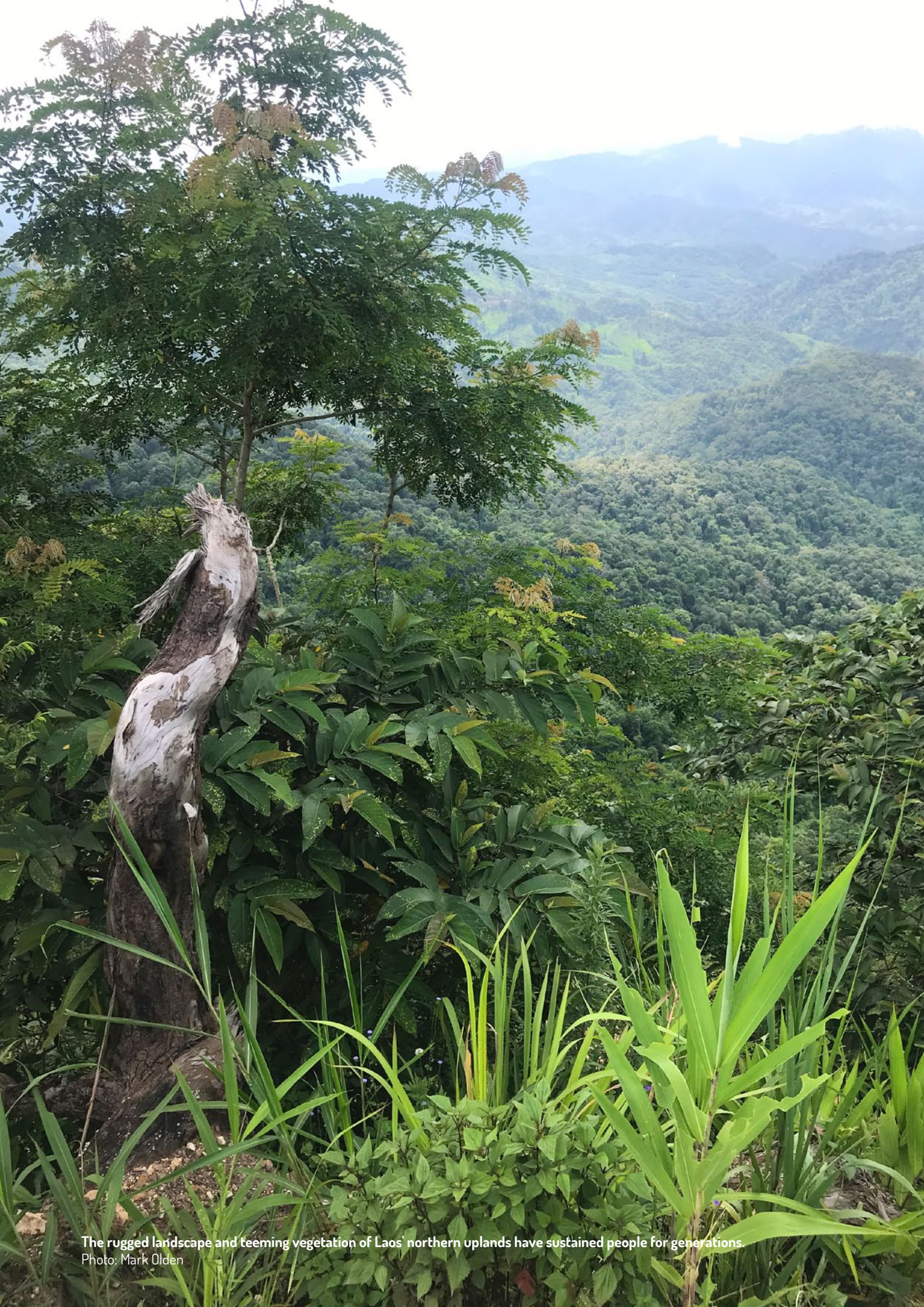
The rugged landscape and teeming vegetation of Laos' northern uplands have sustained people for generations.