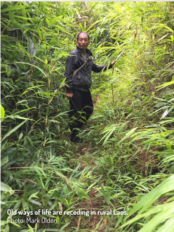
Old ways of life are receding in rural Laos.

In rural Laos, forest communities' way of life is being transformed by foreign investment and climate change. Mark Olden sees how they are adapting.