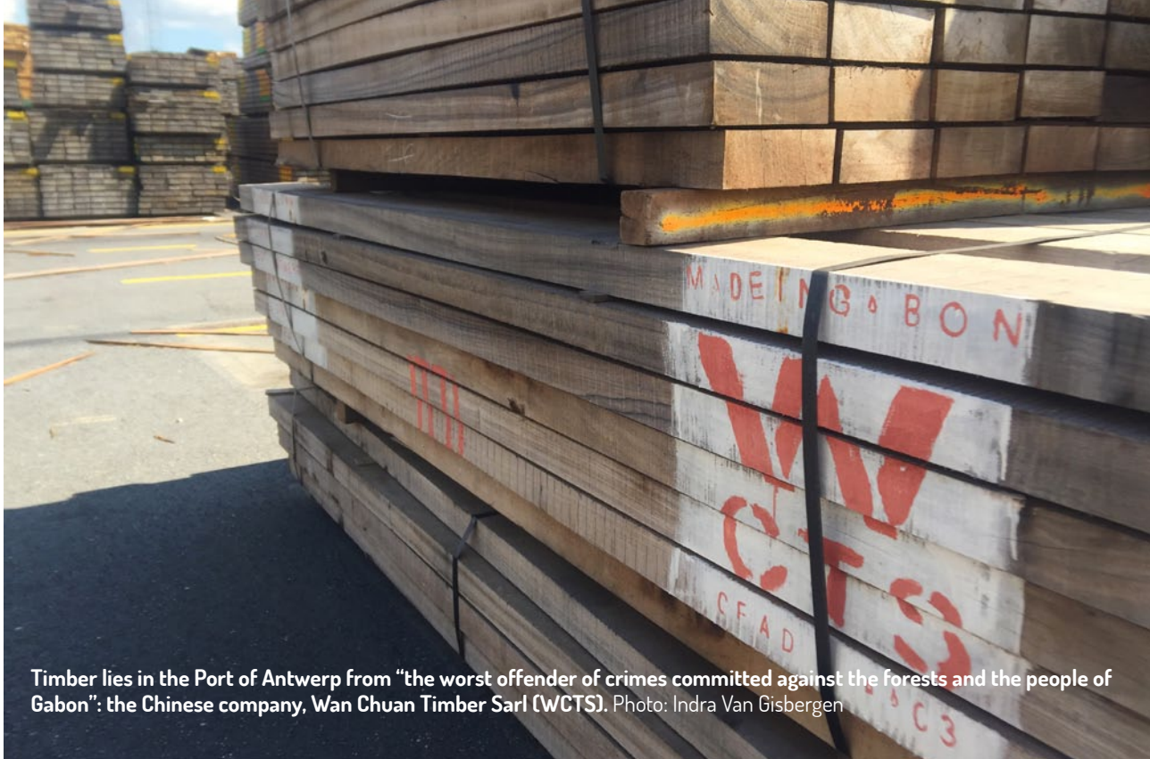
Timber lies in the Port of Antwerp from “the worst offender of crimes committed against the forests and the people of Gabon”: the Chinese company, Wan Chuan Timber Sarl (WCTS).

another, with operators finding it difficult to track developments in some sourcing countries.