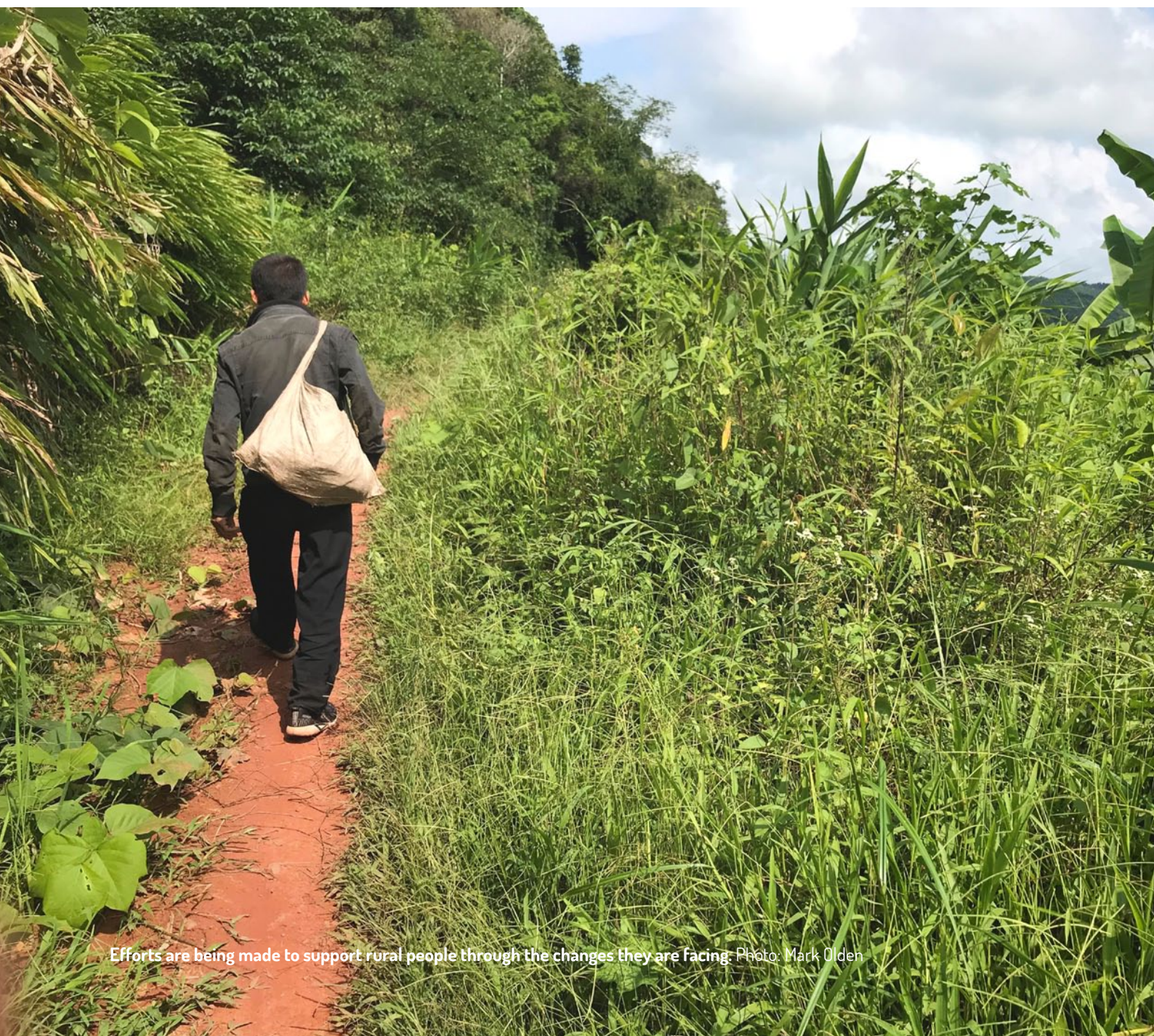
Efforts are being made to support rural people through the changes they are facing.

Each day he wakes early, feeds his chickens and pigs, then heads out, walking many kilometres as he tends to his rice and cotton fields, and gathers fruit and bamboo.