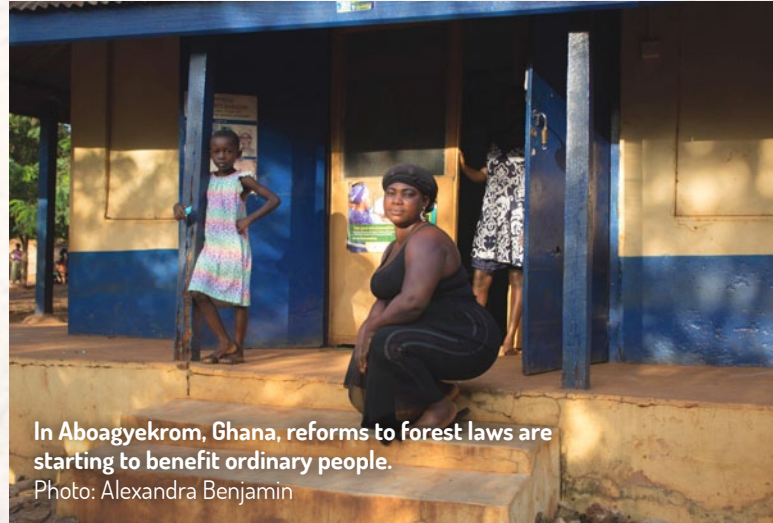
In Aboagyekrom, Ghana, reforms to forest laws are starting to benefit ordinary people.