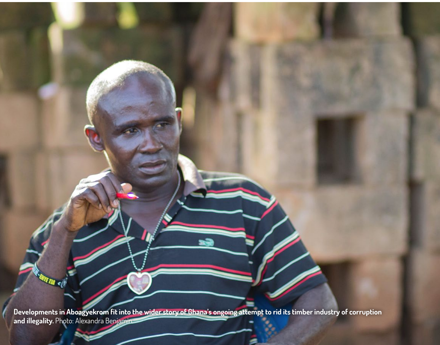
Developments in Aboagyekrom fit into the wider story of Ghana's ongoing attempt to rid its timber industry of corruption and illegality.