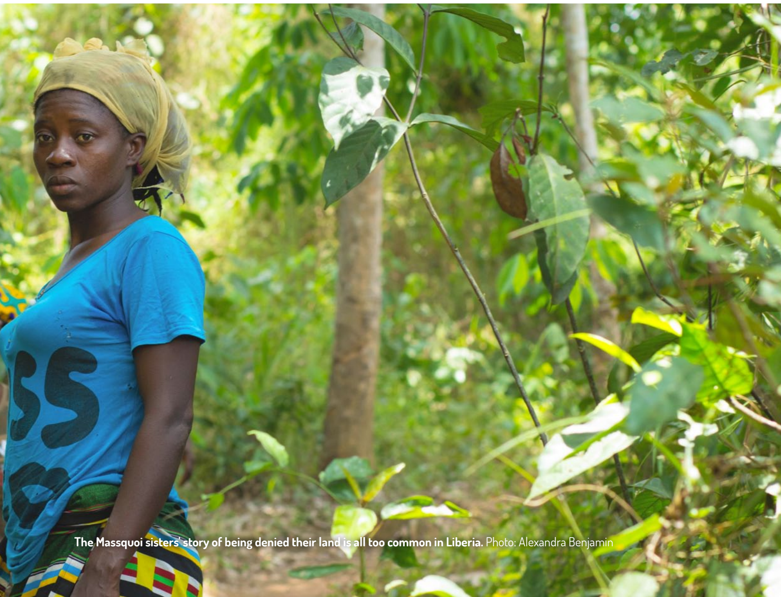
The Massquoi sisters' story of being denied their land is all too common in Liberia.

In a nation where only 27 per cent of women are literate , compared to 60 per cent of men, she says she was lucky that her parents were able to support and encourage her education.